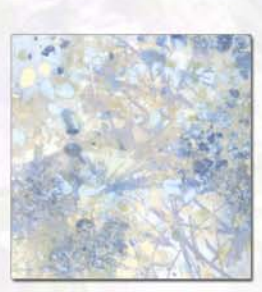
PN037 Seamist #174