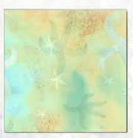
PN039 Seaside #484