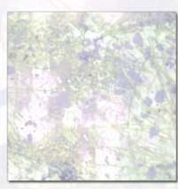
PN037 Crystal #330