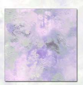
PN038 Crystal #330