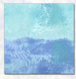
PN040 Breeze #492