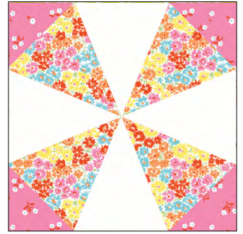
Pink Corner on Fabric Triangle