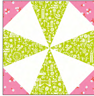
Pink Corner on White Triangle

These instructions are to make 1 block. Refer to the quilt photo for piece placement. Sew a White Wiltshire Blender triangle to a printed fabric triangle. Repeat to make 4 sections. Sew the 4 sections together to make the center of the block. Sew the Primrose Hill B triangles to each corner to finish the block. Refer to quilt photo to know whether to place the Primrose Hill B on the White Wiltshire Blender or printed fabric corners. See diagram below. Repeat to make a total of 16 Blocks.