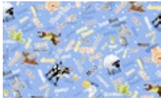
1\frac{1}{2} yd. SB20415-76 Suggested Backing