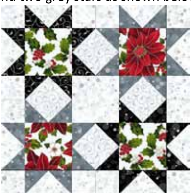
Figure 3 – Star Block – Make 18.

6. Draw a diagonal line from corner to corner on the wrong side of the G8555-113S Frost Silver 4-7/8" squares. Layer the marked squares right sides together with the Q7634-213S Onyx Silver 4-7/8" squares. Sew \frac{1}{4} " away from each side of the marked line. Cut along the line and press the seams toward the dark fabrics. Make a total of seventy-two HST (Figure 4).