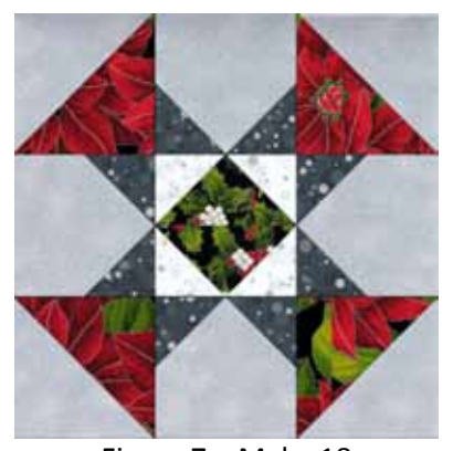
Figure 7 - Make 18

9. Assemble blocks as shown below (Figure 7):