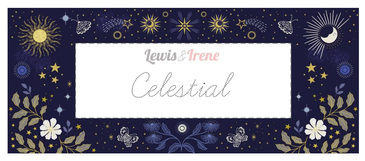
Designed and made by Sally Ablett - Quilt 2

Size of runner 60" x 60" - unfinished block size 12\frac{1}{2} " x 12\frac{1}{2} " - 4\frac{1}{2} " x 12\frac{1}{2} "