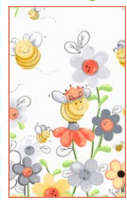
3/4 yd for pillowcase body