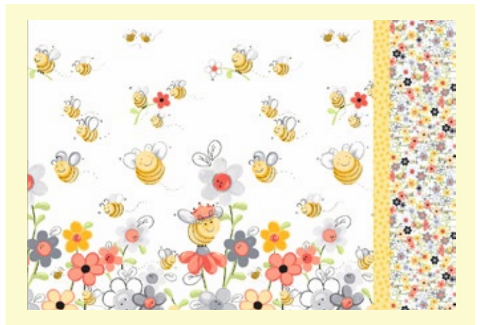
Standard Size Pillowcase

Includes complete instructions and link to a detailed video tutorial.