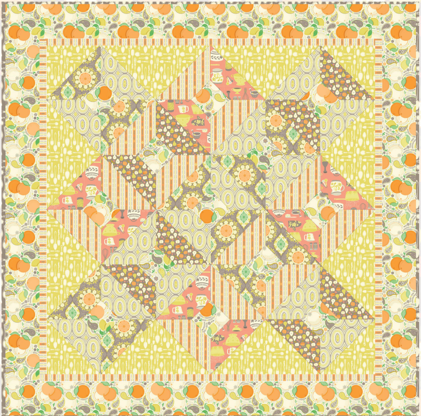
Quilt Design by Metropolitan Quilt

Fresh-picked fruits scatter about a colorful orchard of pretty paisleys and blossoms in the Clementine Collection. Orange, green, citron and sky blue hues adorn pots, pans and silverware for a unique charm from farm to table. This delightful collection is ideal for culinary accessories such as dish towels, aprons, pot holders and more. See the entire Clementine collection on our website: www.blendfabrics.com