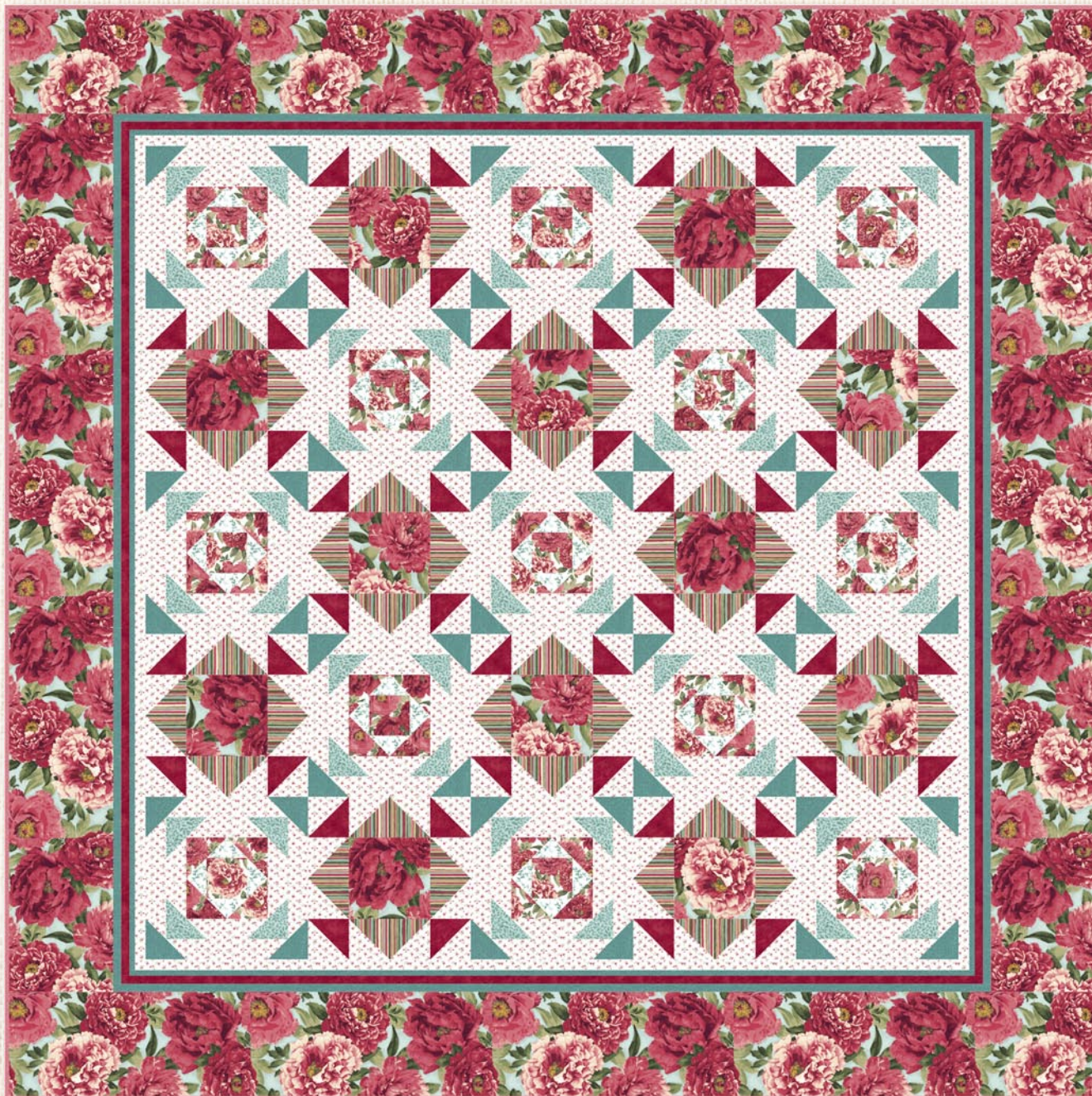
"Plentiful Peonies" by Patti Carey based on the Fragrance colorway of Beautiful Blossoms

Northcott USA 1099 Wall St. West, Suite 135 Lyndhurst, NJ 07071 201.672.9600